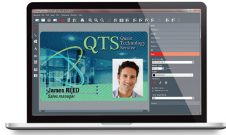
Evolis Badge Studio®+ card personalization software (including import from databases)