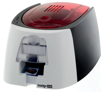
Badgy200 card printer