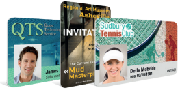
Online card template library