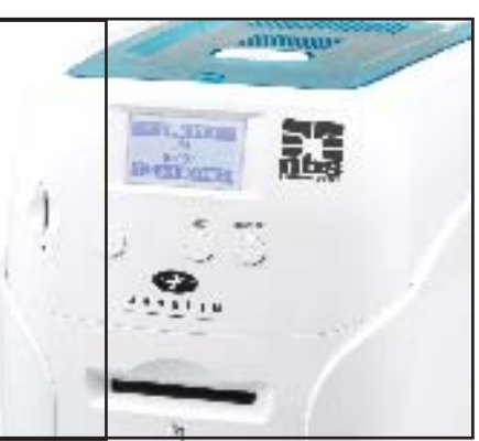
Additional security features and dual hopper option

Easy to read 4 line LCD screen for clear notifications and prompts