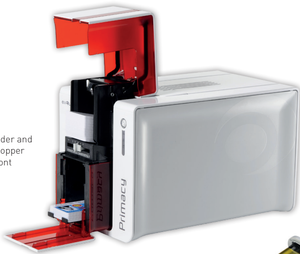
Card feeder and output hopper at the front