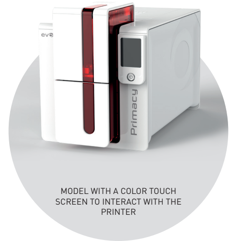
MODEL WITH A COLOR TOUCH SCREEN TO INTERACT WITH THE PRINTER